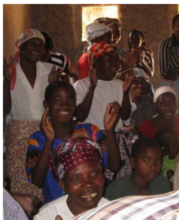
This photo shows the joy that singing brings to members of the Macedonia Methodist Church in Nicoadala (Sunday, October 4, 2009.)